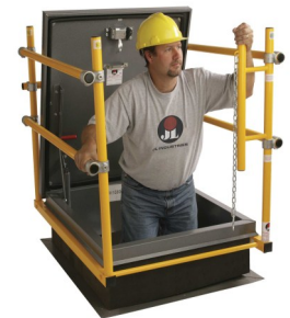
RHG with Optional Saf-T-Hatch Railing