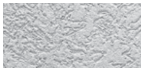
530 SWIRL FINE