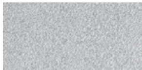
533 SAND SMOOTH