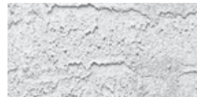
532 MULTI TEXTURE