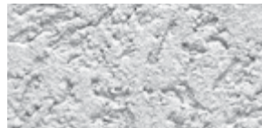
531 SWIRL COARSE