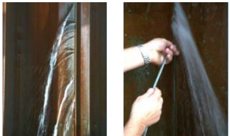
STOP FLOWING WATER