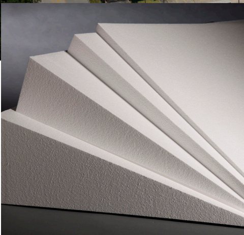
ThermalStar Roof Insulation Tapers

Insulation is a vital component of a building's envelope. For building designers requiring the highest quality rigid insulation, ThermalStar ® Rigid Insulation provides unmatched quality, with a stable long term R-value that will last the lifetime of your structure. Manufactured under an industry leading quality control program monitored by UL and ICC-ES, ThermalStar Rigid Insulation meets or exceeds ASTM C578 standards, providing an HFC free, recyclable rigid insulation with a low Global Warming Potential (GWP).