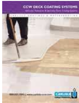
CCW Deck Coatings

CCW provides a complete line of waterproofing solutions and the expertise to help you select the one that is best for your project.