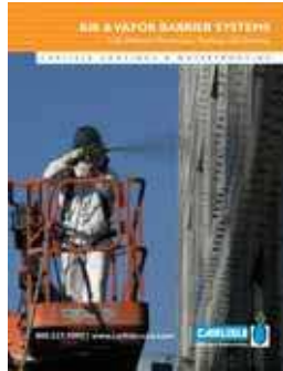
Air & Vapor Barrier Systems