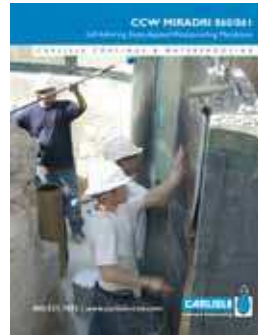
CCW MiraDRI® 860/861