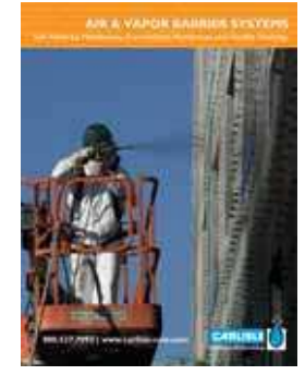
Air & Vapor Barrier Systems