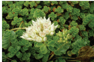
Sedum album 'Coral Carpet'