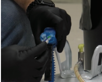
Application of petroleum jelly to spray gun