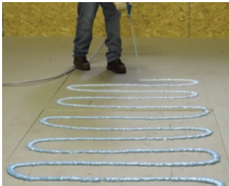
Apply using extension nozzle