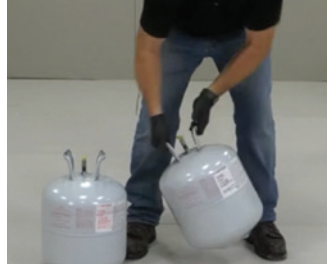
Shaking of A-side and B-side tanks