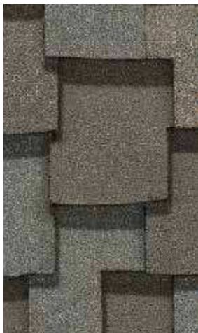
Solaris Country Gray CRRC Product ID 0668-0128