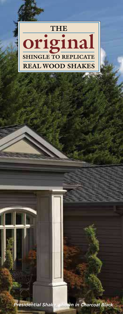
Presidential Shake, shown in Charcoal Black