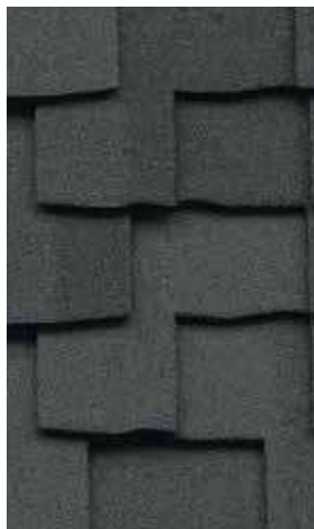
Solaris Charcoal Black CRR Product ID 0668-0132