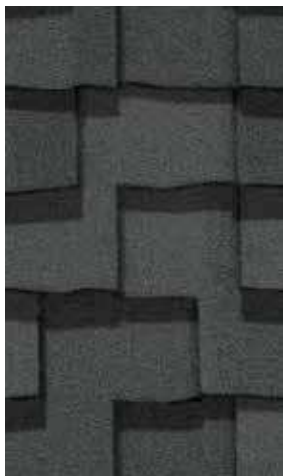
Solaris Charcoal Black CRRC Product ID 0668-0132