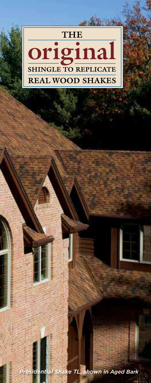
Presidential Shake TL, shown in Aged Bark

THE original SHINGLE TO REPLICATE REAL WOOD SHAKES