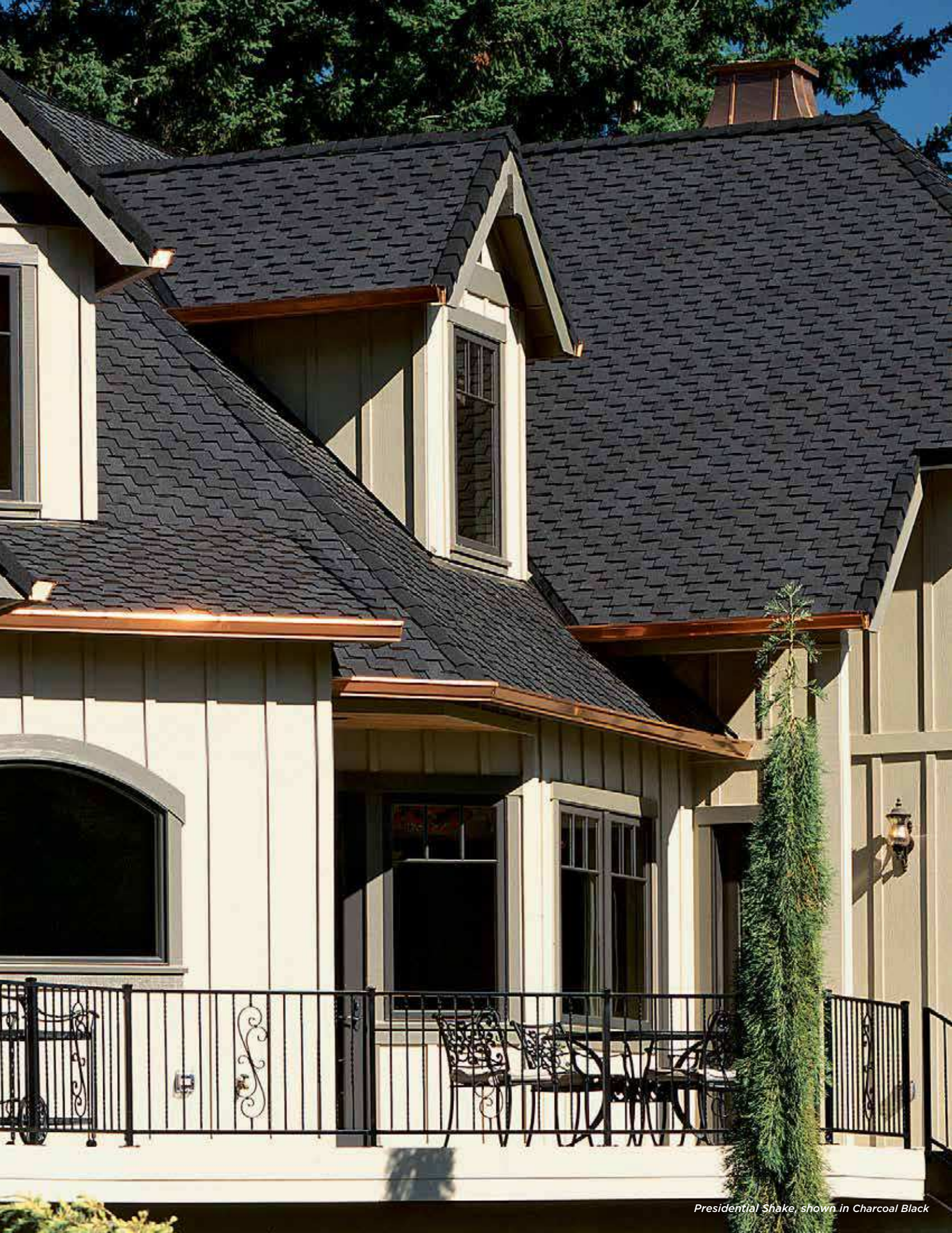
Presidential Shake, shown in Charcoal Black