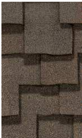
Solaris Autumn Blend CRRC Product ID 0668-0127