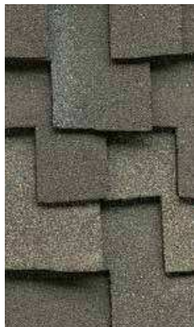
Solaris Country Gray CRR Product ID 0668-0128