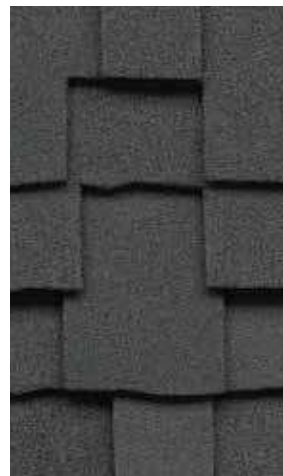
Solaris Shadow Gray CRR Product ID 0668-0134