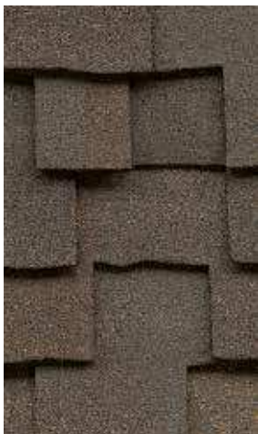
Solaris Autumn Blend CRR Product ID 0668-0127