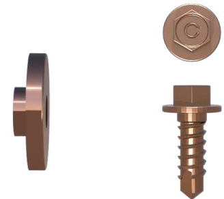
Proprietary Deflection Screw