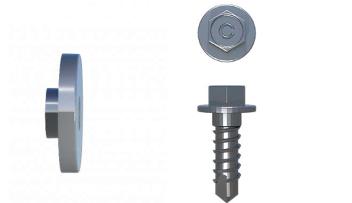
Proprietary HD Deflection Screw (10ga and 12ga Clips Only)