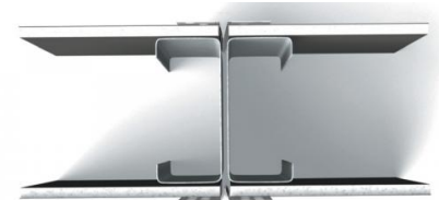
1 Hour Fire Rating (1) 5/8" Type "X" Drywall on each side