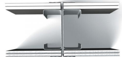
2 Hour Fire Rating (2) 5/8" Type "X" Drywall on each side