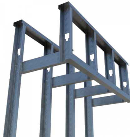
Drywall Framing - Bulkhead Leading Edge