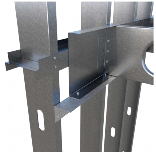
Structural Framing - Ledger Support