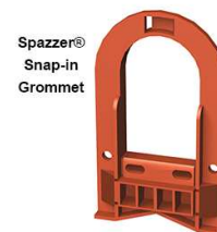
Spazzer® Snap-in Grommet