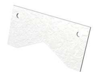
Spazzer® Bar Guard™