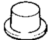
F45 Cap Plug

If care is taken in the placement of concrete and in the use of vibrators, the F45 Plastic Plug is a satisfactory mounting device. Available for use with 3/8", 1/2", 5/8", 3/4", 1" and 1-1/4" National Course (NC) threaded inserts.