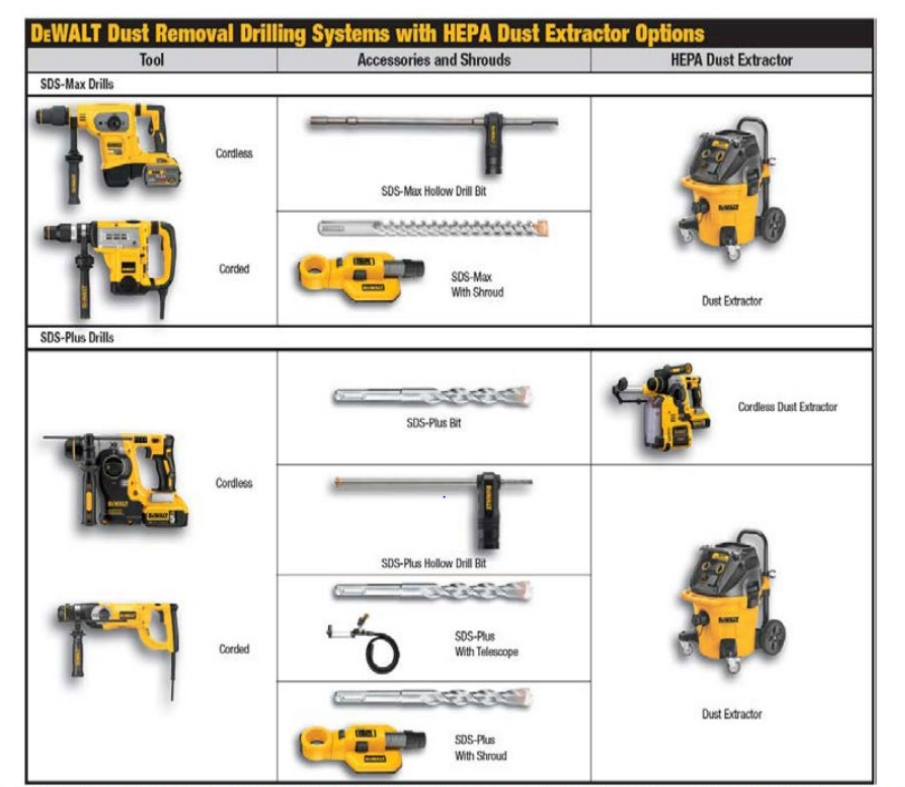
The DEWALT drilling systems shown below collect and remove dust with a HEPA dust extractor during the hole drilling operation in dry base materials using hammer-drills (see step 1 of the manufacturer's published installation instructions).

DEWALT 701 EAST JOPPA ROAD TOWSON, MARYLAND 21286 (800) 524-3244 www.DEWALT.com anchors@DEWALT.com