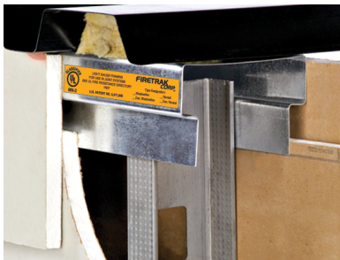
Standard Wall 1" Movement