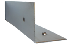
Corner Guard Straight Edge