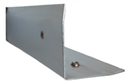
Corner Guard Wing Edge with Holes