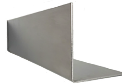
Corner Guard Straight Edge with Holes