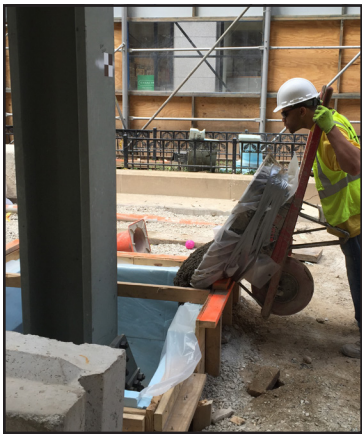
Pouring the DP Epoxy Grout