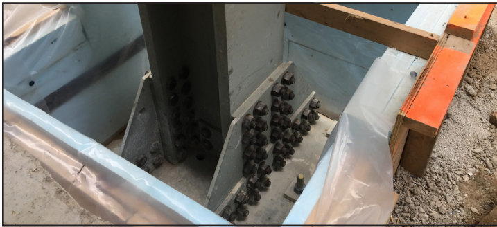
Preparation Includes Creating Forms Around the Beams