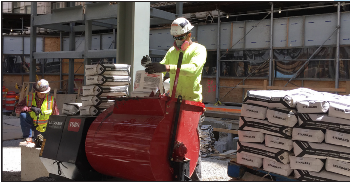
Readying/Mixing the DP Epoxy Grout