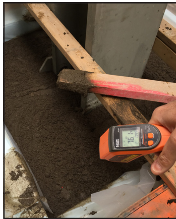
Monitoring Exotherm After Single 36" Pour