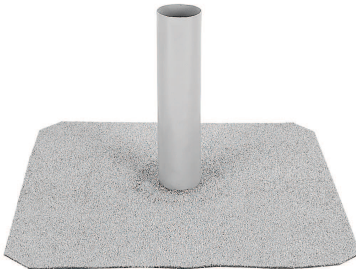
Leakbuster™ Mwend Pre-Flashed Lead Jack