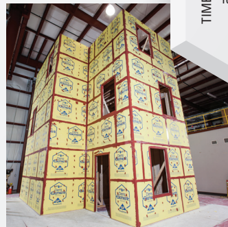
Trial 3: DensElement® Barrier System

The results presented reflect the findings on specific construction assemblies under test conditions. Actual results may vary depending on the system, the building, the installation methods, and other factors.