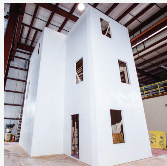
Trial 2: Fluid-Applied Membrane WRB-AB System