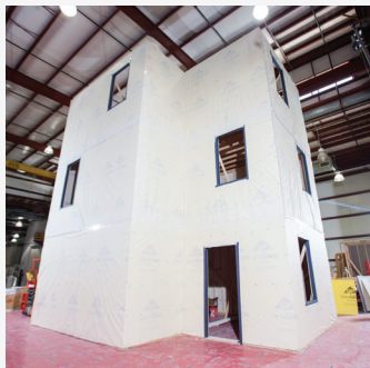
Trial 1: Building Wrap WRB-AB System