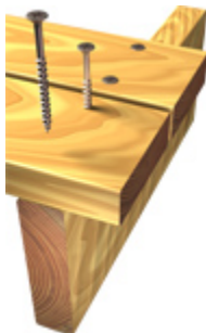
Bugle Head Coarse Thread Stainless

Certifications: All GRABBER® screw products are manufactured in facilities that are ISO 9001 certified. The fasteners comply with ASME B18.6.1. ©2012 GRABBER Construction Products, Inc. GRABBER®, STREAKER®, DRIVALL®, LOX®, GRABBERGARD® and SCAVENGER® are registered trademarks of Grabber Construction Products, Inc.