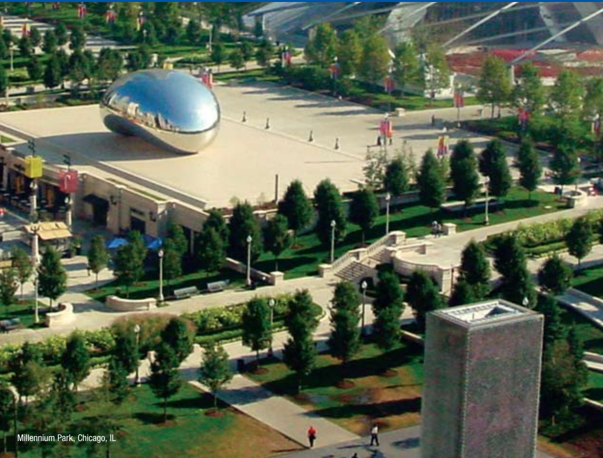
Millennium Park, Chicago, IL