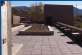
Henry's single-source warranty offers coverage on pavers, edging, drain inspection covers and insulation.

Once a novel idea, vegetative roofs have gained widespread acceptance due to the many practical, financial, and environmental benefits they provide. In addition to creating more usable amenity space in the form of rooftop terraces, walkways, plazas and gardens, a vegetative roof assembly can: