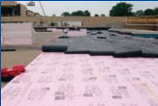
A Drain Board/Water Retention Mat is strategically located at the soil level to protect the drainage plain and insulation from root damage.