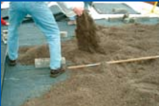
Henry's FLL certified growing media has just the right amount of organic material.