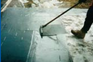
Application of our time-tested 790-11 hot rubberized waterproofing membrane, proven effective in thousands of applications.