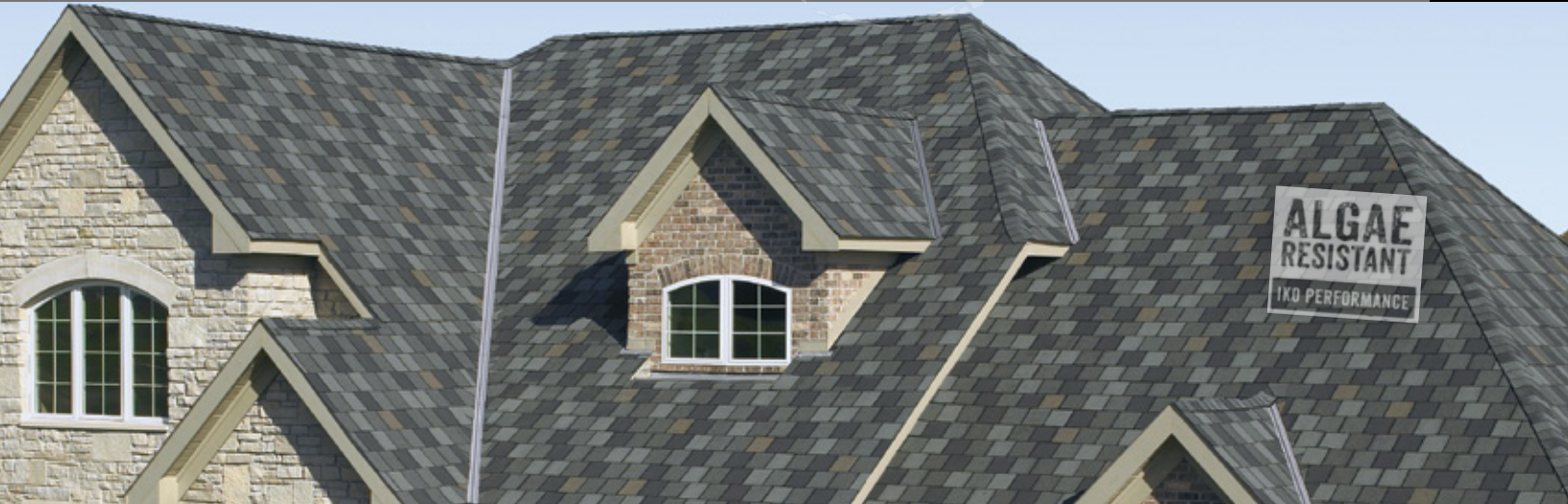
Color Featured: Regal Stone