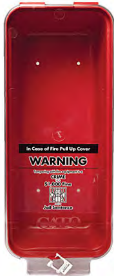
Shown as red tub with clear cover

Cato's affordable fire extinguisher series, manufactured in the U.S, provides a dent and rust proof alternative to metal. Cato's Warrior series fire extinguisher cabinet is a two- piece construction with a locking seal. No additional padlock is required. Simply pull up to break the seal and remove the cover to access extinguisher inside.