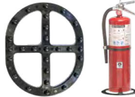
10300 - Fire Extinguisher Rust Prevention Tray Accessory