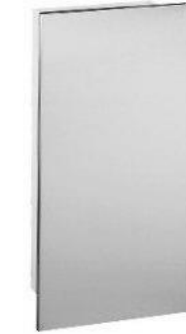
5634S21 Stainless Steel