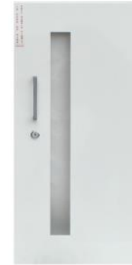
5614W10 Steel with Pull Handle and Saf-T-Lok