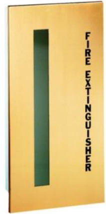
5654V10 Brass With Concealed Pull