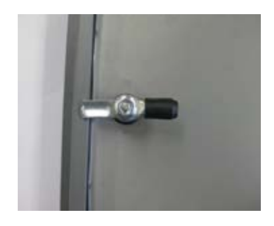
Inside Latch for (H4) Removable Flush Locking Handle