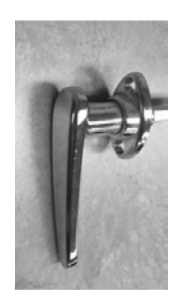
H2 Non-Locking Handle (Standard)