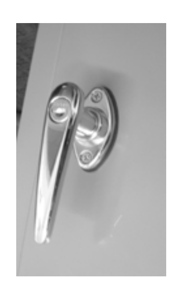
H3 Locking Handle