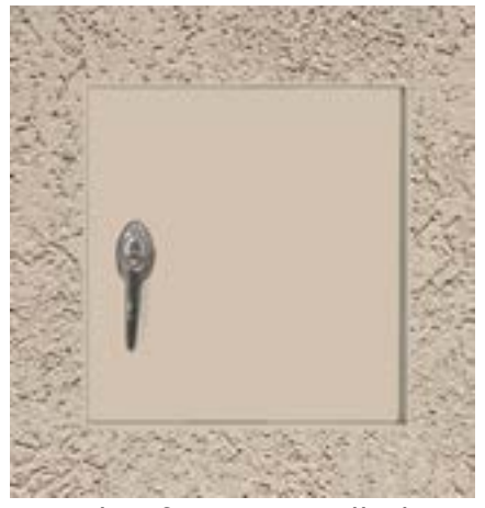
Example of XPEA Installed in Stucco Wall