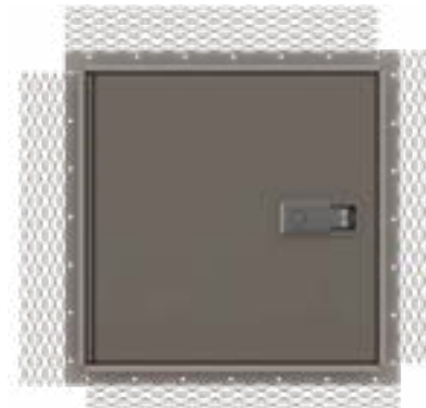
XTES with Optional Latch (F6)

Frame: 16 ga. Stainless Steel Frame Door: 2" Thick Polyisocyanurate insulation, 20 ga. Stainless steel door with continuous hinge and R value of 13.0 Gaskets: Adhesive backed EPDM foamed silicone rubber seal on frame and door Finish: 304 Stainless - No. 4 Finish Handles: (F4) Lockable compression paddle latch, black