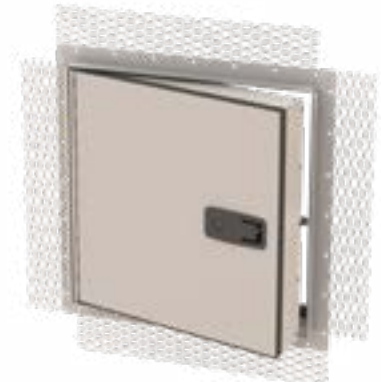
XTEA with Standard Latch