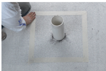
2. Mask & Cut the Scrim