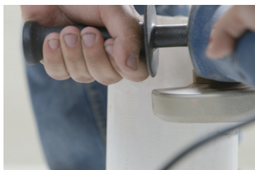
1. Abrade & Clean the substrate

JM PMMA Flashing resin is combined with catalyst and JM PMMA Fleece reinforcement to form a monolithic, self-adhering and self-terminating reinforced penetration flashing membrane for a wide variety of penetrations.