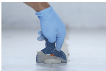
1. Joint Compound

Joint compound applies more simply; just spread over the seam, filling it.