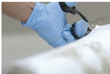
1. Measure & Cut the Scrim

With liquid roofing, measure and cut the scrim to cover the seam. Spread liquid roofing on the seam; then work the scrim into the liquid. Aim for a full, void-free coating: 0.21 to 0.45 kg/ft 2 (approx. 90 mils thick).