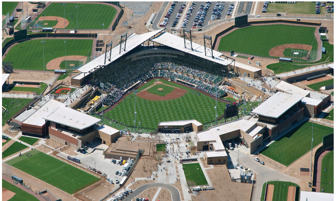
Salt River Fields at Talking Stick, Scottsdale, AZ