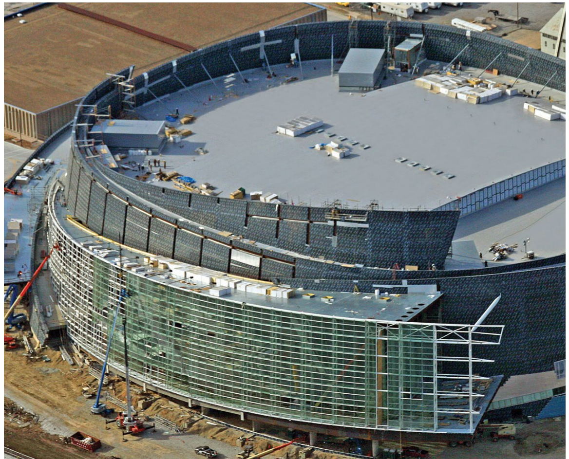
Cover: U.S. Bank Stadium, Minneapolis, MN

Because, like other great traditions, integrity is what truly stands the test of time.