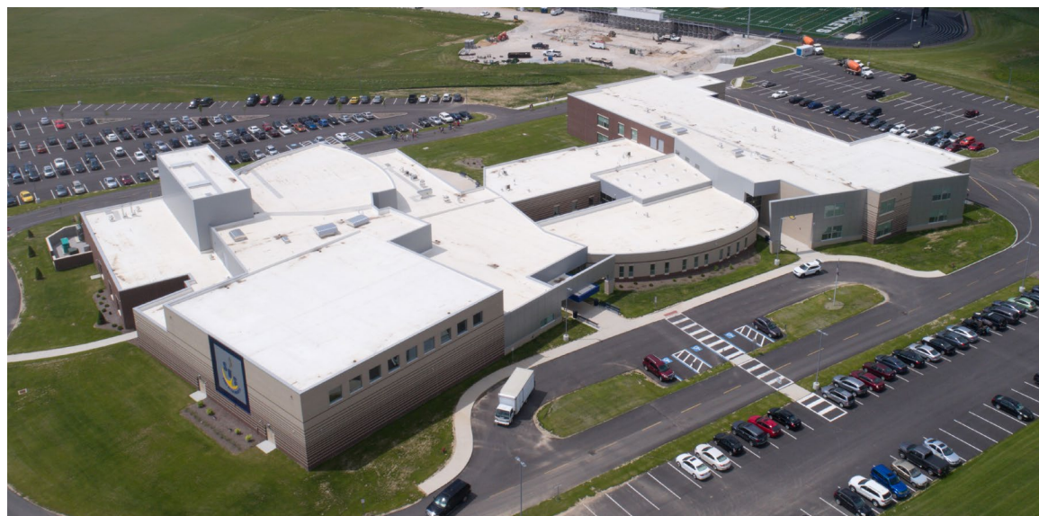
Streetsboro High School Streetsboro, OH