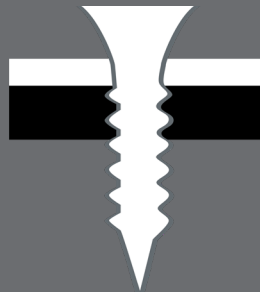
SELF SEALING SBS ASPHALT FORMULATION