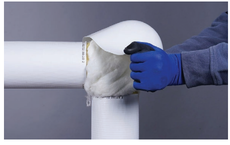
4 . Insert two stainless steel serrated tacks approximately ¼" (6 mm) from one of the lap edges of the fitting cover. Then snap the cover in place over the fiber glass insulation.