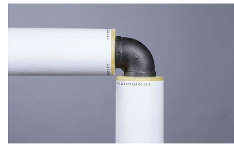
1. Zeston PVC insulated fitting covers are quickly installed over ells, tees, valves and other pipe fittings. Combined with Micro-Lok<sup>®</sup> HP jacketed pipe insulation, they provide a complete, color-coordinated system.