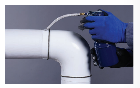
3. After the fitting cover has cured at least 10 minutes, run a bead of adhesive along its circumferential edge. Overlap the fitting cover (by approximately 1" [25 mm]) with a section of Zeston PVC jacketing and secure the circumferential joint with an elastic cord. The cord may be removed after approximately 10 minutes.