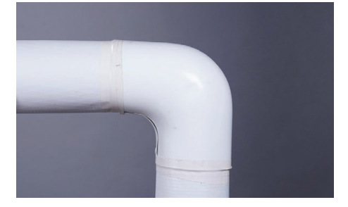
8. The completed insulated fitting cover provides a neat, finished look that enhances the overall appearance of the system. When installed, Zeston PVC insulated fitting covers offer long service life with little or no maintenance, at a low installed cost.

7. Apply Z-Tape over the circumferential joints. The tape should extend over the adjacent pipe insulation and overlap itself by at least 2" (51 mm) on the downward side of the lap. The tape provides securement, an attractive appearance, and completes the vapor seal.