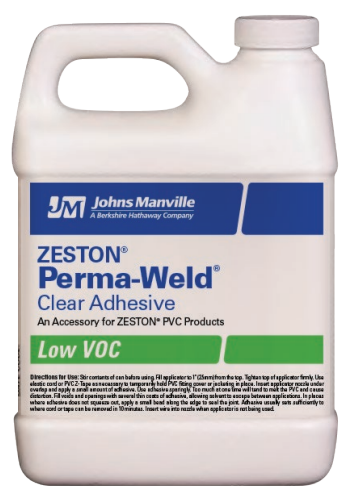
Zeston Perma-Weld low VOC adhesive contains less than 510 g/L volatile compounds and meets California's SCAQMD 1168 Rule

For high-temperature installation, slip-joints shall be applied periodically between fixed supports and on continuous long runs of straight piping. Slip-joints