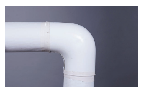
7. The completed insulated fitting cover provides a neat, finished look that enhances the overall appearance of the system. When installed, Zeston PVC insulated fitting covers offer long service life with little or no maintenance, at a low installed cost.

Note : Where pipe insulation thickness is greater that 1\frac{1}{2} " (38 mm) or pipe temperature is below 45°F (7°C) or above 250°F (121°C), additional inserts must be used. (A "rule of thumb" for temperatures over 250°F [121°C] or below 45°F [7°C], or insulation thicker than 1\frac{1}{2} " [38 mm], is to use one Hi-Lo® Temp Insert for each additional 1" [25 mm] of pipe insulation.)