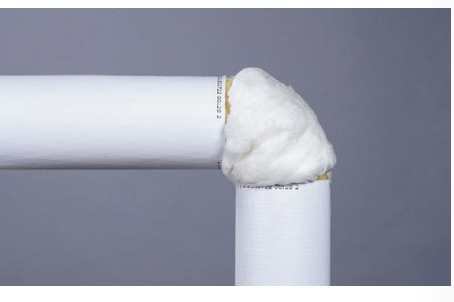
3 . Butt the ends of the fiber glass insert against the ends of the pipe covering. Tuck and fold the insulation so that it covers all bare surfaces. Keep the fiber glass fluffed up to the thickness of the adjacent pipe insulation to assure maximum thermal efficiency.

2 . Place the pre-cut fiber glass insert around the fitting, positioning the points of the insert on the inside radius of the elbow. For applications with temperatures below 45°F (7°C) or above 250°F (121°C), additional layers of insulation may be required.* In such cases, the first layer is secured by wrapping with fiber glass yarn.