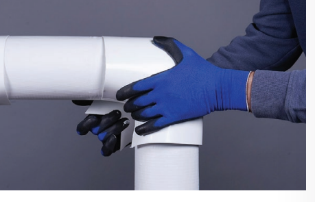
6 . Place the fitting cover over the insulation, lapping the mastic-covered edge over the other side of the throat seam.