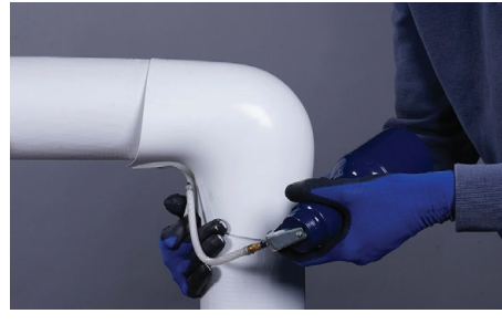
2 . Using a standard applicator gun or squeeze bottle, apply a bead of Perma-Weld adhesive along the throat overlap of the fitting cover. Snap the fitting cover into place and secure with elastic cord or PVC tape. Always feather the adhesive along the seam.