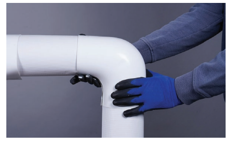
5 . After the fitting cover is in position, push the tacks into the overlapping throat seam. No further fastening is required.