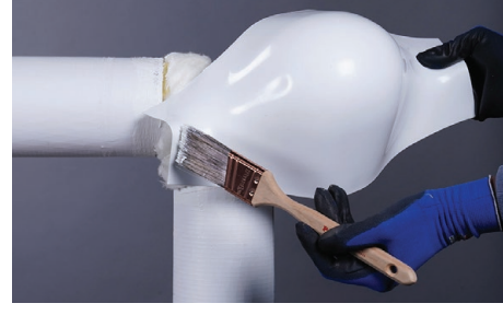
5 . Apply the mastic along the inside of the fitting cover throat overlap seam. Pressure-sensitive Z-Tape or serrated tacks may also be used.