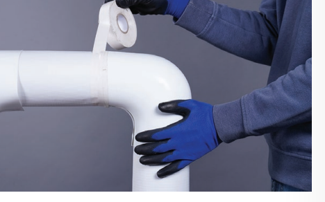
6 . As an option, apply color-matched, pressure-sensitive Z-Tape to the butt joints for a more attractive appearance.