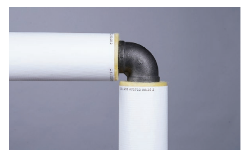
1. Zeston PVC insulated fitting covers are quickly installed over ells, tees, valves, and other pipe fittings. Combined with Micro-Lok<sup>®</sup> HP jacketed pipe insulation, they provide a complete, color-coordinated system.