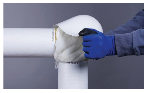
1 . Position the Zeston PVC fitting cover over the insulated fitting.

The following sequence describes the installation of Zeston PVC jacketing and fitting covers with Perma-Weld solvent welding adhesive.