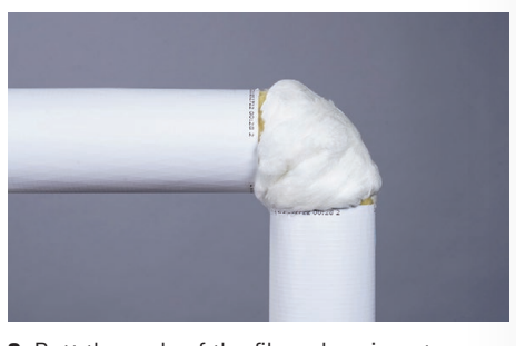
3 . Butt the ends of the fiber glass insert against the ends of the pipe covering. Tuck and fold the insulation so that it covers all bare surfaces. Keep the fiber glass fluffed up to the thickness of the adjacent pipe insulation to assure maximum thermal efficiency.

2 . Place the pre-cut fiber glass insert around the fitting, positioning the points of the insert on the inside radius of the elbow. For applications with temperatures below 45°F (7°C) or above 250°F (121°C), additional layers of insulation may be required.* In such cases, the first layer is secured by wrapping with fiber glass yarn.