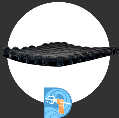
TriDent™ DD 050