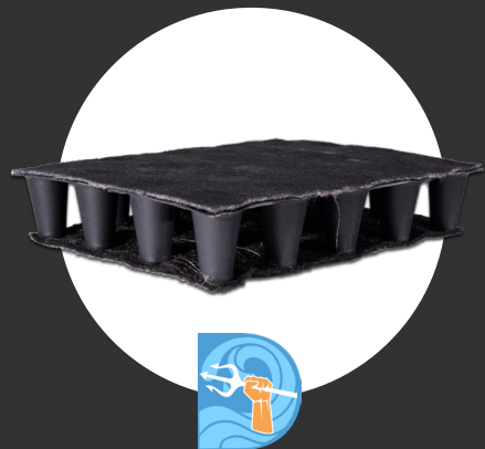
TriDent™ DD 100