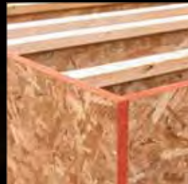
LP® SolidStart® Rim Board