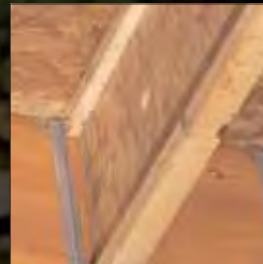
LP® SolidStart® I-Joists