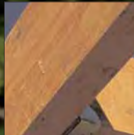
LP® SolidStart® Laminated Veneer Lumber (LVL)