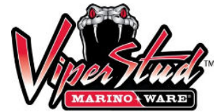
09.22.16 Non-Structural Metal Stud