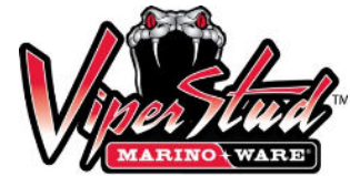
09.22.16 Non-Structural Metal Stud