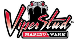
09.22.16 Non-Structural Metal Stud