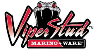
09.22.16 Non-Structural Metal Stud