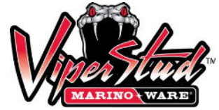
09.22.16 Non-Structural Metal Stud