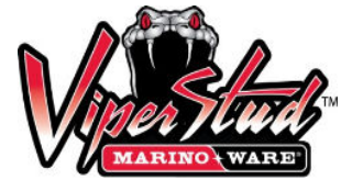
09.22.16 Non-Structural Metal Stud