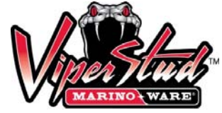
09.22.16 Non-Structural Metal Stud