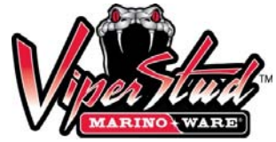
09.22.16 Non-Structural Metal Stud