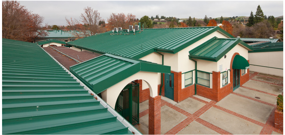
Charlotte Wood Middle School, Danville, CA