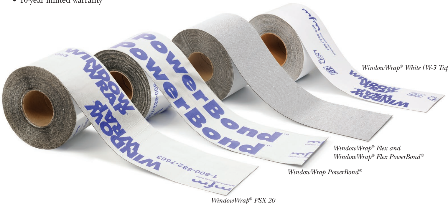
WindowWrap® White (W-3 Tape)

WindowWrap® products are suitable for new construction or home renovation projects. These professional grade products are proven performers and reduce expensive call backs.