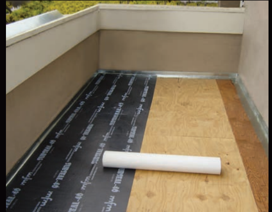
SubSeal is an excellent choice for waterproofing balcony decks and other surfaces that will be finished with concrete or tile.

Call one of our professionals today at 800-882-7663 to get your project on the right track.