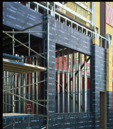
SubSeal is ideal as a through-wall flashing under siding, or exterior plaster and masonry where high moisture content is present.