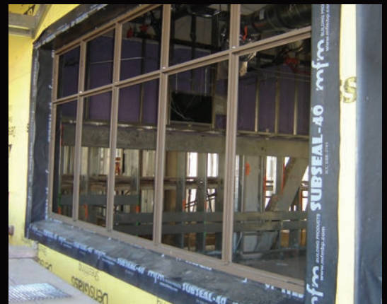
SubSeal bonds aggressively to poured concrete and other building materials. It is fully adhered to the substrate to eliminate movement of water under the membrane.