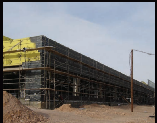
SubSeal offers high strength, high elongation and is flexible to accommodate expansion and contraction of the substrates.