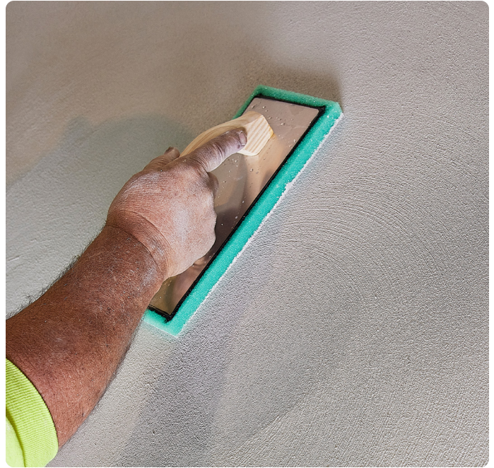
Finish (second) coat (Smooth or Texture Finish)