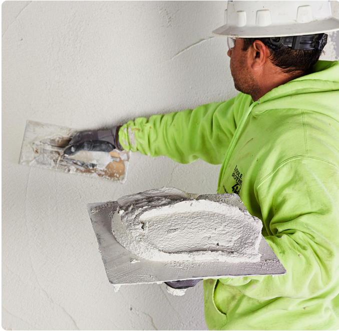
Base (first) coat on Kal Kore Plaster Base

Leave surface sufficiently rough and porous to provide suitable bond of the finish coat.