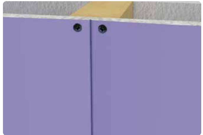
0 No taping, finishing or accessories required.

Note: It is recommended that the final decoration specification (e.g., painting specification) include the application of a priming material prior to the decoration.