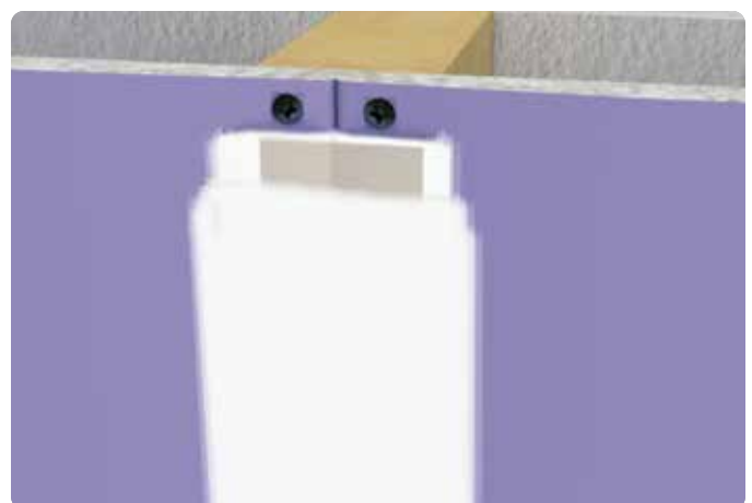
2 Thin coating of compound over all joints and interior angles.