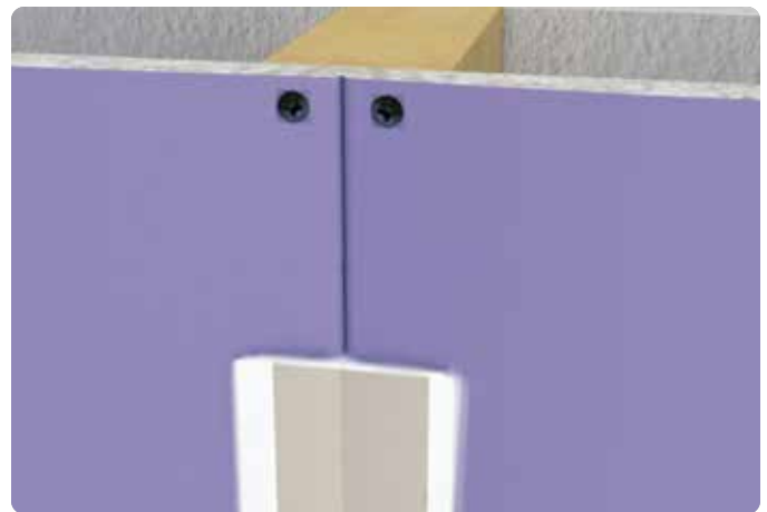
1 All joints and interior angles have tape set in compound.