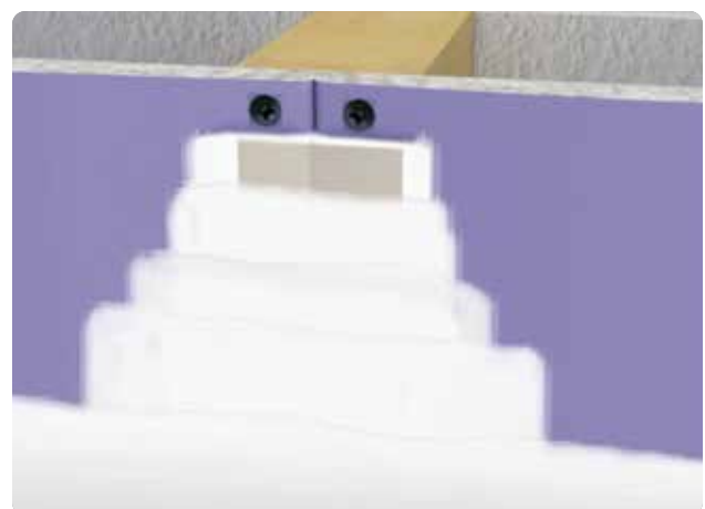
5 Skim coat applied over entire surface. Surface smooth and free of tool marks or ridges.

For more information, refer to Gypsum Association document, GA-214.