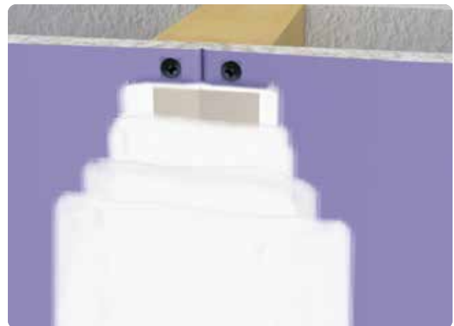
4 Another coating of compound over flat joints, smooth and free of tool marks or ridges.