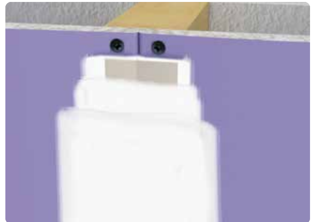
3 Additional coating of compound over joints and interior angles. Smooth and free of tool marks and ridges.

Note: It is recommended that the final decoration specification (e.g., painting specification) include the application of a priming material prior to the decoration.