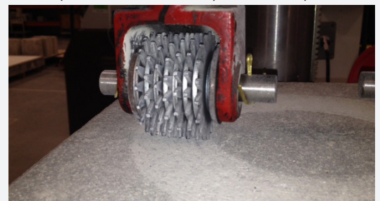
The ASTM C779 Procedure B uses steel dressing wheels to test the abrasion resistance of concrete surfaces.